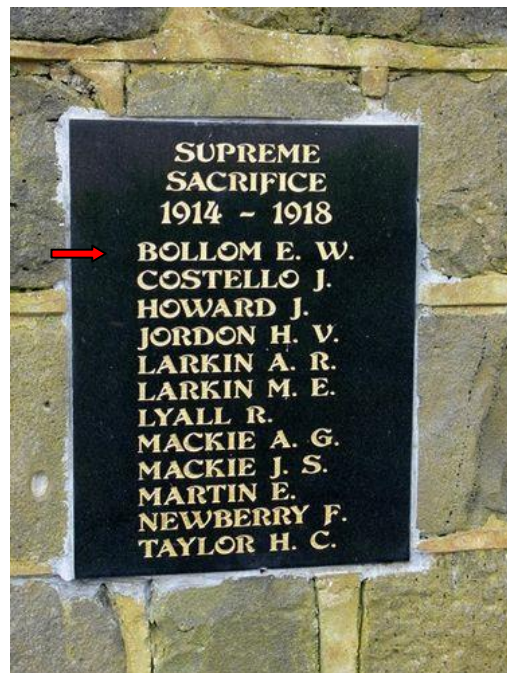
Tarwin Lower War Memorial