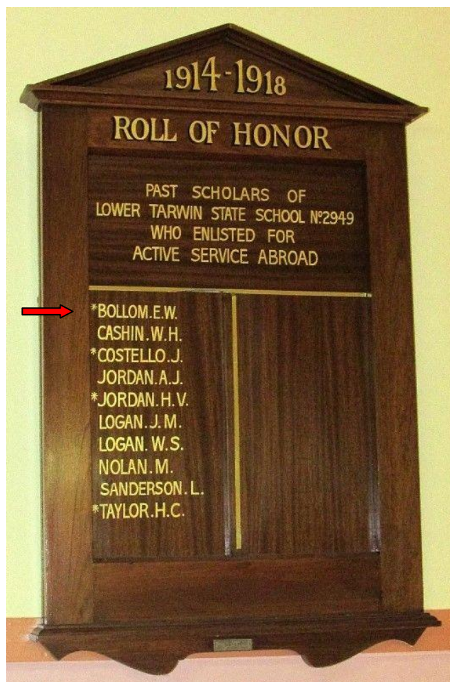
Lower Tarwin State School Roll of Honor & below Tarwin Lower Memorial Hall Mechanics Institute