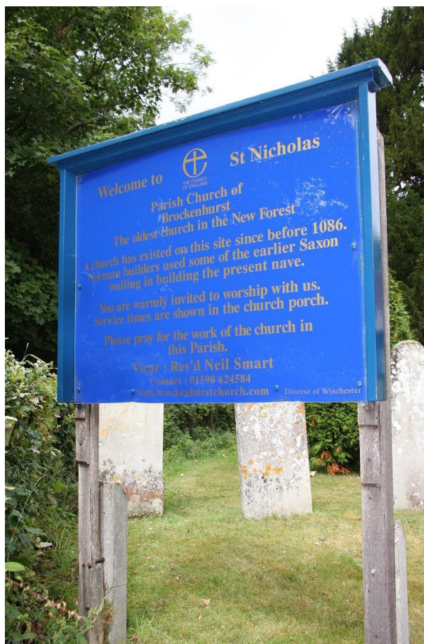
St. Nicholas' Church, Brockenhurst