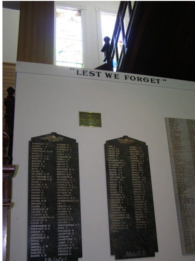
Leongatha and District Fallen Soldiers Honour Roll